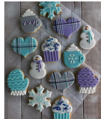
Winter themed iced cutout cookies